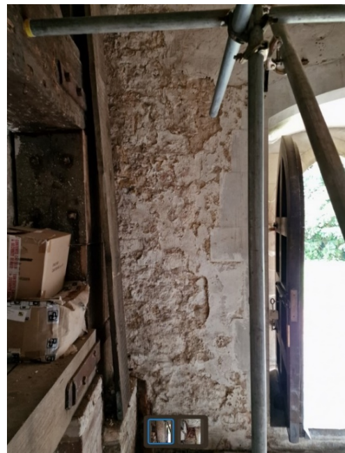
Inside the Bell Tower