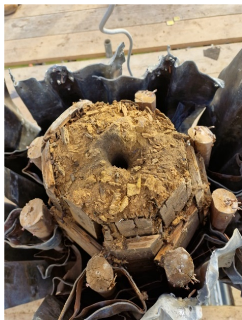
Rotten timberwork at the top of the spire