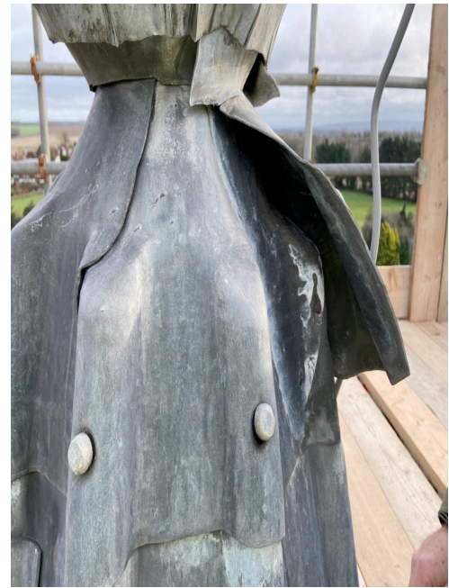
The weathervane that sits on top of the spire